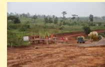
Construction site of the irrigation project