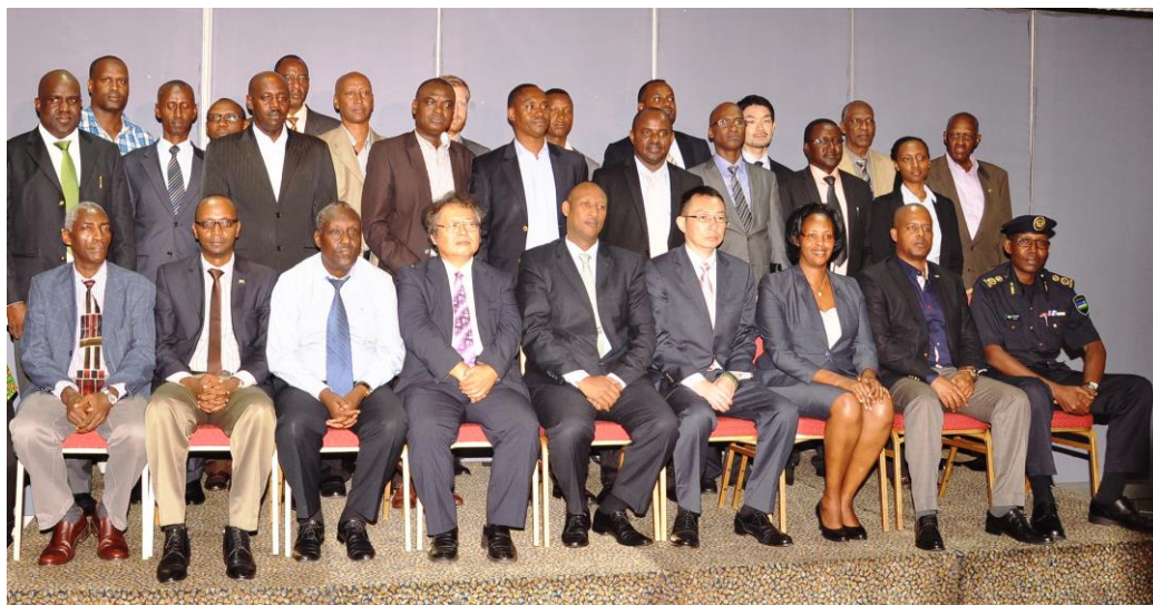
Group photo of high officials who attended JICA 10 TH Anniversary event at Umubano Hotel in December 2015

JICA shared with stakeholders in Rwanda the achievements in the past ten years and the way forward to strengthen the cooperation