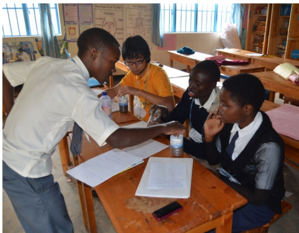
Students at TTC Muhanga performing experiments lessons

From 12th to 15th December 2016, 21 students from TTC Muhanga, Save and Nyamata had a workshop on “Make Up lesson” in TTC Muhanga. This workshop was organized by 7 JICA Volunteers in field of science and mathematics education; BEST group (Better Education in Science and Teaching).