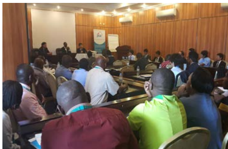
WASAC Staff following the presentation from Kobe City Waterworks