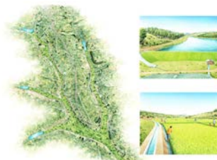
Projections photos of Rwamagana sites to irrigate

JICA is going to start new technical cooperation project with entitled "Water Management and Capacity Building" this year. Under this project, the capacity of irrigation scheme management by Irrigation Waters Users Organizations (IWUOs) will be enhanced by analyzing current situation of water management as training IWUOs. Through these works, JICA continues to cooperate to achieve Rwandan irrigation development.