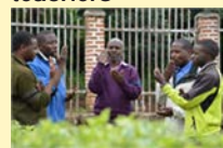
Teachers learning sign language