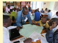
Teachers train themselves on the new curriculum