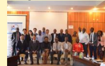
Stakeholders who attended the JCC