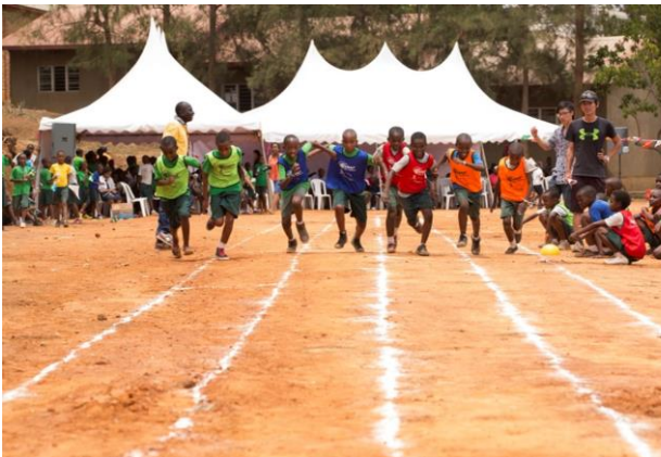
Children running at the relay race on Undokai