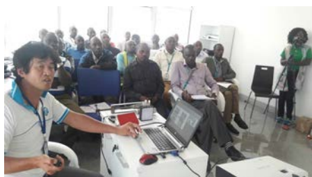
A JICA expert conducting a training for WASAC STAFF.

Sustainable water supply is the foundation of people's better life and country's growth. Non-Revenue Water (NRW) makes up one of the challenge to achieve it. NRW is the water that has been produced but not billed to the customer due to water leakage, metering inaccuracies, errors in data management and etc.. Water and Sanitation Corporation (WASAC) Ltd. has put its maximum effort to attain sustainability, and started "Project for Strengthening Non-Revenue Water Control in Kigali City Water Network" with JICA from 2016. As the key activity in the technical co-operation project, WASAC developed "five years strategic plan for non-revenue water reduction". The plan was officially approved by the board of WASAC in April 2018. At the