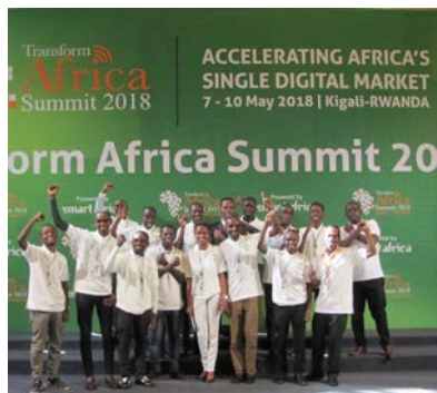
Winners of Startup250 companies after the pitching session at TAS2018

Rwanda's ICT sector industrial association, PSF ICT Chamber, has taken a leading role in realization of the country's ICT led development with JICA's support through GoR from its beginning. The partnership among GoR, ICT chamber and JICA entered new chapter last year when