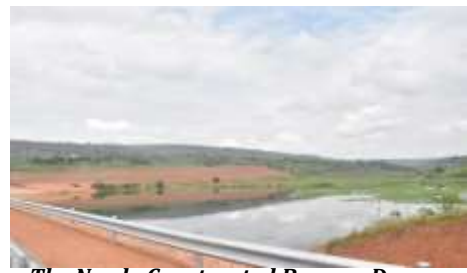
The Newly Constructed Bugugu Dam

change, supporting food security and increasing farmers' income. Moreover, it will contribute to the Economic Recovery Plan set out by the Government of Rwanda to respond to the COVID-19 outbreak, which has slowed down economic activities including agriculture.