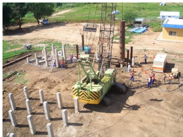
Construction of water treatment plant