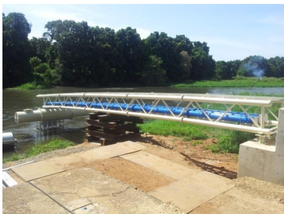
Installed water intake facility: Warren Truss Bridge

The Project aims to improve the capacity of the water supply system of Juba by constructing water intake facilities, a purification facility, a distribution reservoir, transmission pipelines, 120 public tap stands and eight water tanker filling stations. Due to the rapid increase of population in the capital city and the lack of adequate water supply facilities, people of Juba have limited access to safe and clean water which is causing water-borne diseases and economic burden. Upon completion of the Project, SSUWC will be able to provide clean and safe drinking water to over 400,000 people in Juba. JICA has also implemented technical cooperation projects to enhance the management capacity of SSUWC since 2010.