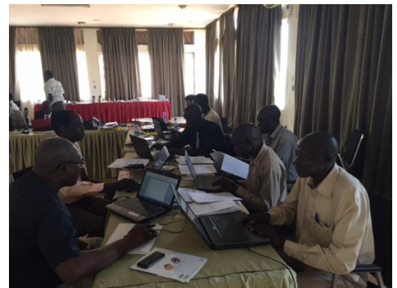
Material development workshop in Kampala