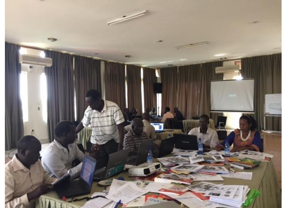
Material development workshop in Kampala

SDGs: SDG 4 (equitable and quality primary education)