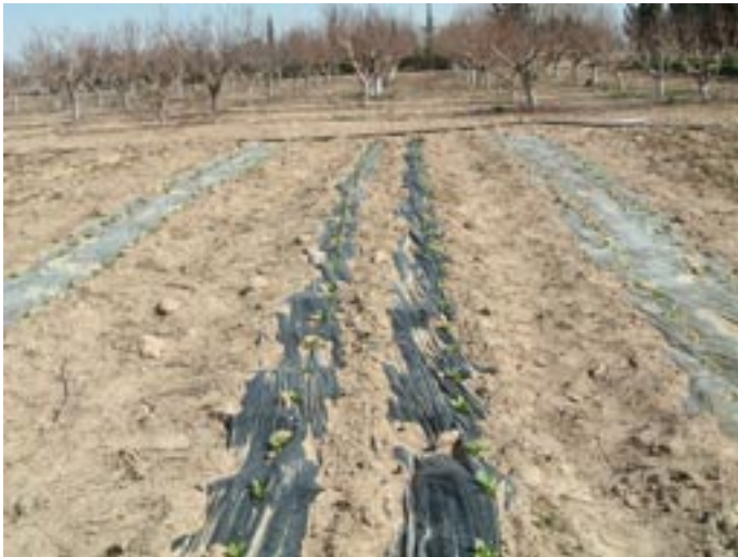
Lettuce planted under different types of Agricultural Films (black- transparent- weeds)

Last summer he has experimented the use different types of Agricultural Films on egg-plant production at GCSAR Nashabieh Research Centre in Rural Damascus. The objective of the experiment is to find the proper arrangement for this plant. The results of that experiment has been evaluated as "very-good", therefore, this winter, another experiment has been scheduled to test the same for lettuce cultivation.