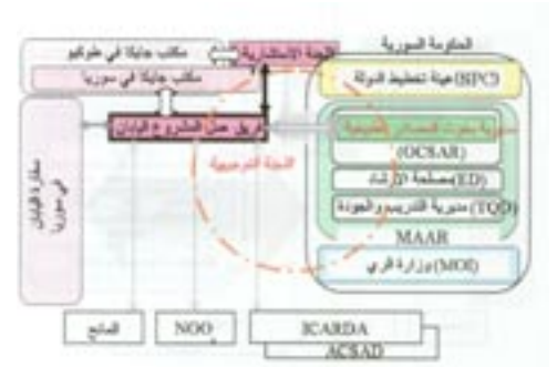
Project implementation Structure

Resources Research (ANRR) in cooperation with many related entities, such as GCSAR, Directorate of Extension, since cooperation and collaboration are necessary elements to ensure efficiency, and sustainability of the project, and they have the full support from JICA.