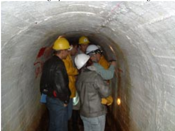
Japanese Consultant, Contractor, and DAWSSA staff discuss repairing techniques

French in 1960s. However, according to JICA's study, this tunnel doesn't have to be repaired along all its length, repair works are distributed among separate stations as indicated in Fig. 1.