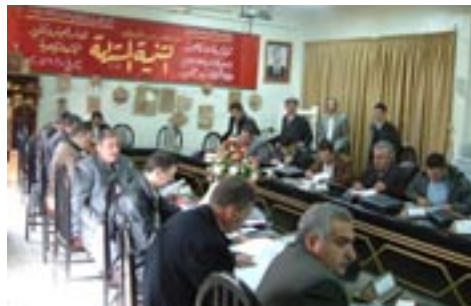
Extensionists' Training in Hama

Within the frame work of the Project on Development of Efficient Irrigation Techniques and Extension in the Syria (DEITEX). a training course has been conducted at Hama Agricultural Extension Directorate.