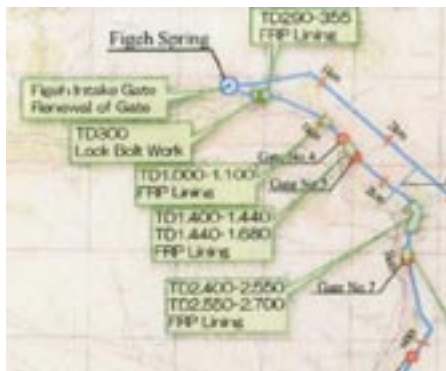
Fig. 1, part of tunnel plan

According to the construction schedule, all works will be completed within calendar year 2006, most of the resources are allocated for rehabilitation of the 16km length, old tunnel, which has been constructed in 1930 and rehabilitated by