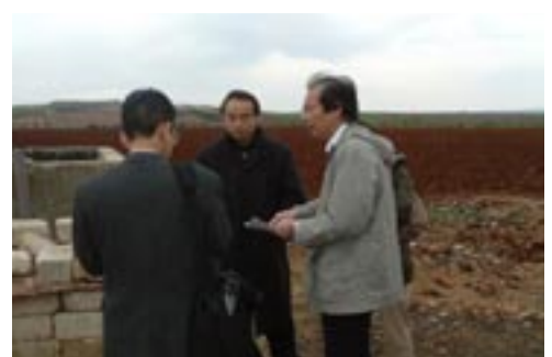
Project Senior Advisor Explains to Resident Representative about the model farm furnishing in Kafer-Zita- Hama

It is worth mentioning that DEITEX project is a 3 yrs. Technical Cooperation Project launched last April, aiming at improving water use efficiency and reduce losses in the farmers' fields of project sites.