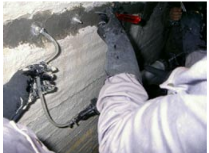
Fig. 3, Crack Filling

Voids between the plate and the concrete will be filled with non-shrinkage mortar to stop leakage water and protect deteriorated and damaged sections (see Fig. 3).