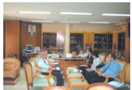
Mission's Kick-off Meeting at SPC

Moreover, the mentioned mission concurs with the workshop of the Ministry concerning the formation of National Standards for each subject, so "JICA has chosen the perfect timing of this project in Syria" this is what Education Ministry's officials have said.