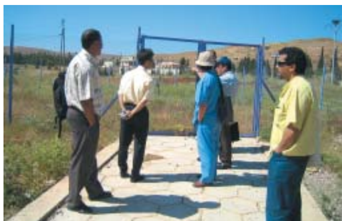
Visiting WRIC meteorological monitoring station

The objective of the visit was to exchange experience with the Syrian organisations concerned in management of water resources for drinking and irrigation, in addition to observe the implementation and impacts of JICA cooperation projects in Syria in the field such as Water Resource Information Centre (WRIC).