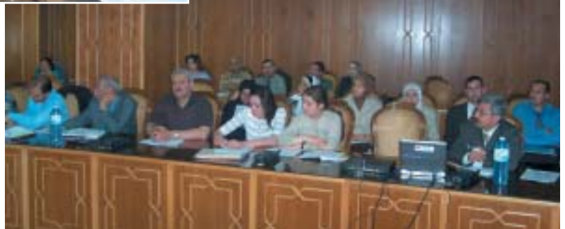
Japanese ODA Request Procedure time line for the year 2005 survey