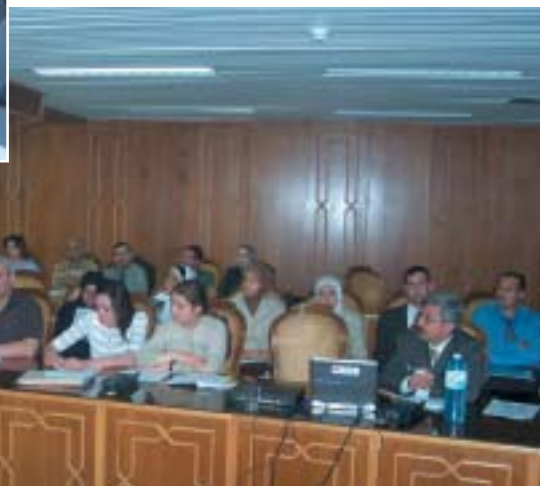
A part of Participants to the meeting from Syrian Ministries