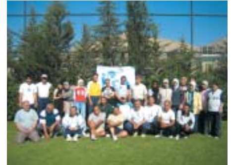
Teachers Training in The Playground