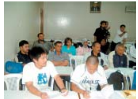
Physical Education Seminar