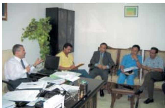
A key visit to Deputy Minister of Housing