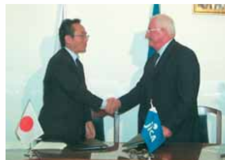
Japan and Syria ... mutual cooperation