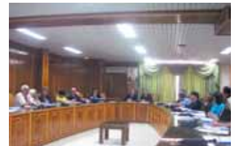
JICA Program Officers delivered presentations about JICA's sectors in Syria

Attendances came from different organizations. They were from United Nations Development Program, European Union Delegation of the European Commission, Royal Netherlands Embassy, German Technical Cooperation Agency, Aga Khan Development Network and Embassy of Spain. In addition to staff concerned from State Planning Commission and Embassy of Japan.