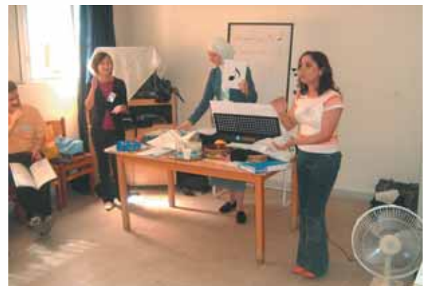
Music Teacher in Homs Workshop