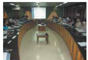
JICA RR & Deputy Head of SPC delivered opening speeches

It is worth mentioning, JICA Syria Office is currently conducting eighteen programs in the aforementioned sectors.