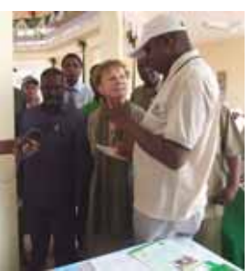
Irish Ambassador to Tanzania, visits AICAD pavilion at NANENANE Show in Morogoro Tanzania.