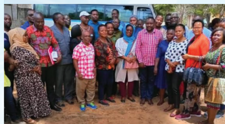
Group Photo with DED Kisarawe (Middle)

About 30 JATA members, made a visit to JICA project on O&OD in Kisarawe district on September 25, 2020. Those members comprised of members from Coast Zone, Dar es Salaam region, Pemba, Unguja, Morogoro, Arusha and Iringa Zone. Others were from Mtwara, Mwanza, Kisarawe District council staff, Media Personnel, JICA Staff, including community members from Chambasi, Msimbu and Homboza villages.