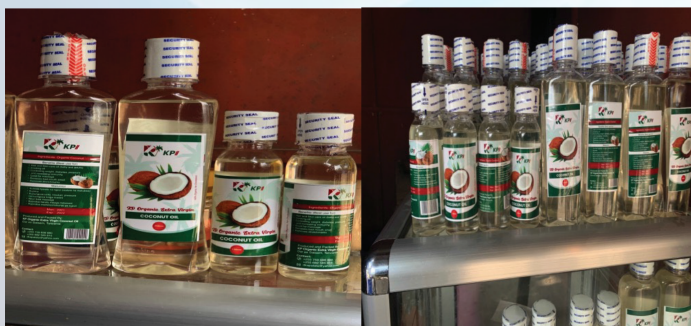
We produce different bottle sizes. Starting from 120mills, 250mills, 1 litre, 5 litres, etc. It depends with customers request.