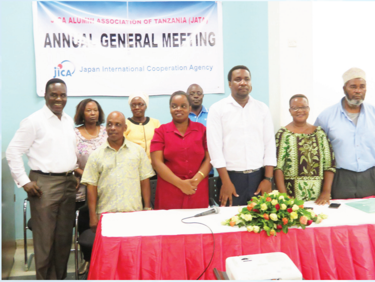
New Executive Committee Members.