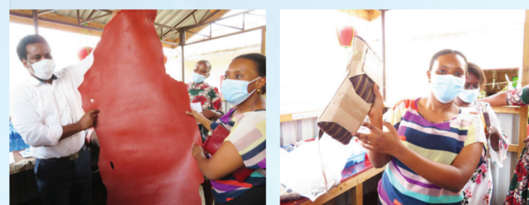
Leather made in Tanzania