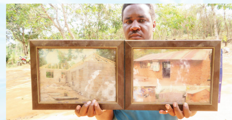
Old and the newly built office of the village leaders.

Kisarawe District, started the implementation of the Improved opportunity and obstacles development project in year 2010 in Msimbu ward located 25 km from Kisarawe town at Homboza village and Mafisi ward at Gwata village 112 km from town. In 2014, improved O&OD progressed to other 12 villages in (Vihingo and Manerumango wards) respectively. The project intends to cover the whole district because of good governance, training, team work and continuous capacity building through the operation "TWENDE SAWA" concept. In this regard, DED, DC, head of departments and ward facilitators (WFs) visit the community twice a month with technical support, identify gaps and participate in community activities like block making as participatory approach.