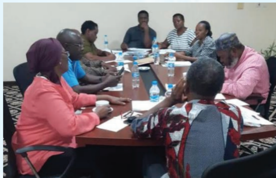
Meeting of Executive Committee Members

The Executive Committee Meetings are held throughout the year as stipulated in our JATA Constitution so as to plan, discuss, reschedule and deliberate on carry out activities for the benefit to JICA and JATA. The JICA staffs working in Tanzania office are invited to harmonize and explain on JICA's rules and regulations including projects visits and activities which are conducted in Tanzania. The JICA staff have to share the information about Japanese companies. The unscheduled of meetings and reallocation of budget play a big role to achieve JATA intended goals.