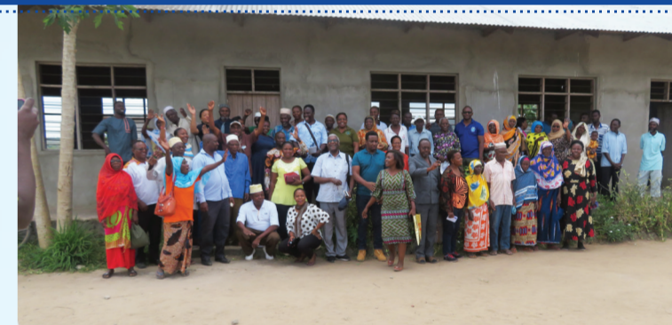
This is a school which was built by the community members under O&OD project