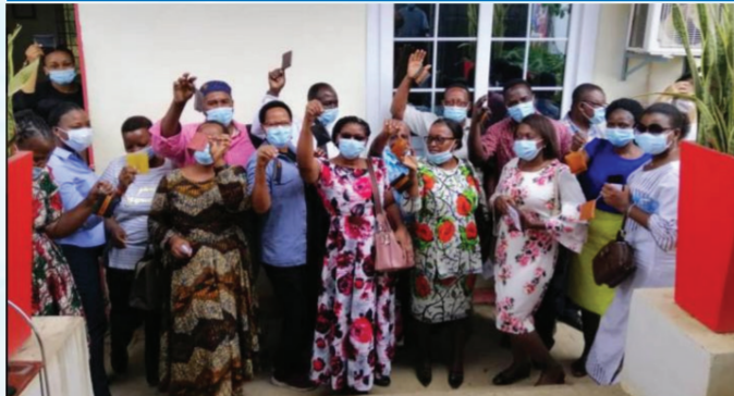
Group photos of JATA members