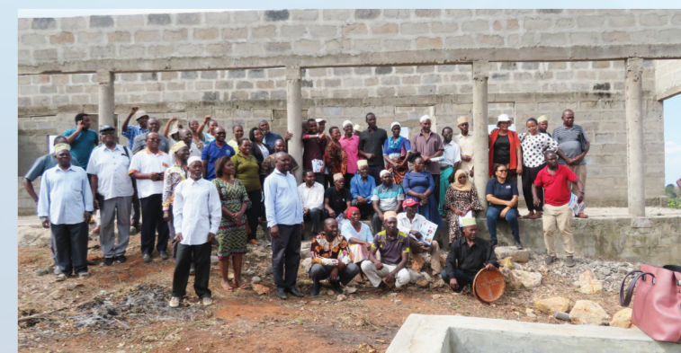
Dispensary which is being built by Community members.

They also provide certificates and sometimes cash to motivate and recognition for those villages which are doing better than others