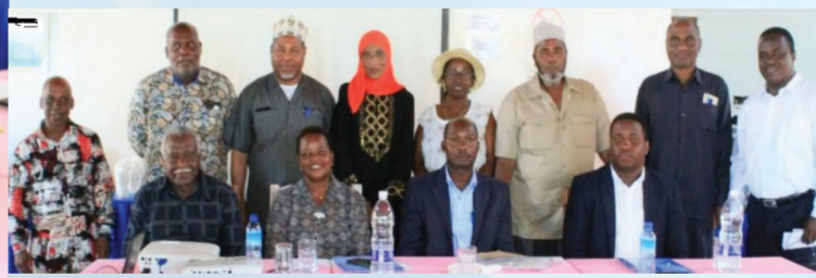
Group photo of Executive Committee members with the Guest of Honor