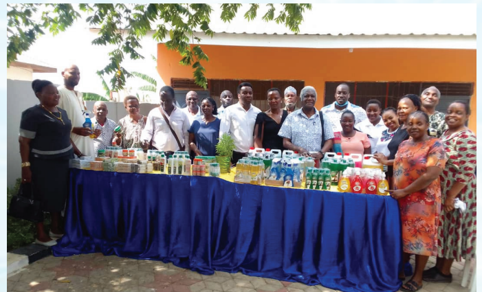
••• The picture of participants on the display table of products produced through cottage industry

Training for production of various products, that the machine they share can produce, managed to the establishment of small/cottage industries like what we visited. The establishment of the small industries as a result of training has managed to prosper with the application of 5S. A home small scale industry for natural cosmetics, honey added and other products like hand liquid wash soap and different types of soap was eye opener to all members. Almost all visiting members managed to purchase different type of products displayed after production because were of high quality and new idea and technology is used to provide service to Tanzanian community.