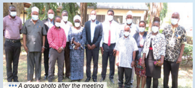
••• A group photo after the meeting

The best practices by JATA members listed were, Fay fashion leather goods production, Coconut virgin oil production. Proper Hand washing practices in the community. Value addition in bee Cosmetics products. Lishe smart project – young children feeding and caring. All these are ongoing practices that community benefits from.