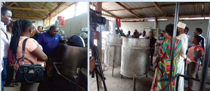
Factory visit showing oil mixing machine | Milk processing machine

The Government of Tanzania (GOT) and Development Partners (DPs) have been implementing Agriculture Sector Development Programme (ASDP) since 2003/04. In ASDP, each Local Government Authority (LGA) formulates and implements District Agricultural Development Plan (DADP), tailor-made to locality.