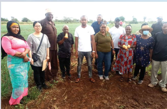
••• The farm visit at Kiterine village -Chekereni in HIMO area