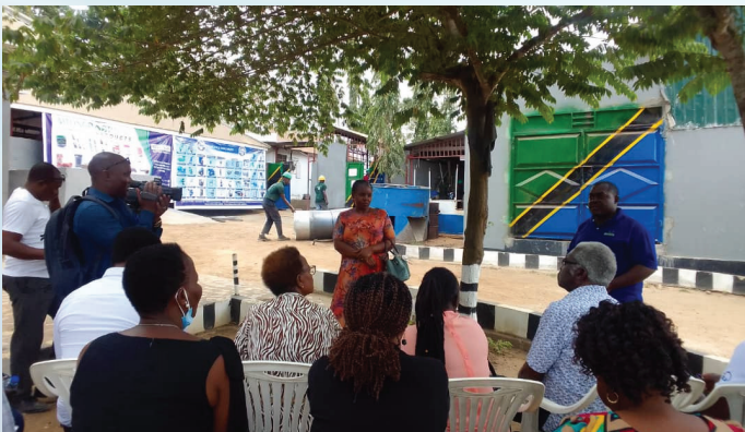
Participants asking questions after factory visit

The technology has facilitated middle industrialization and employment for socio-economic growth and poverty eradication.