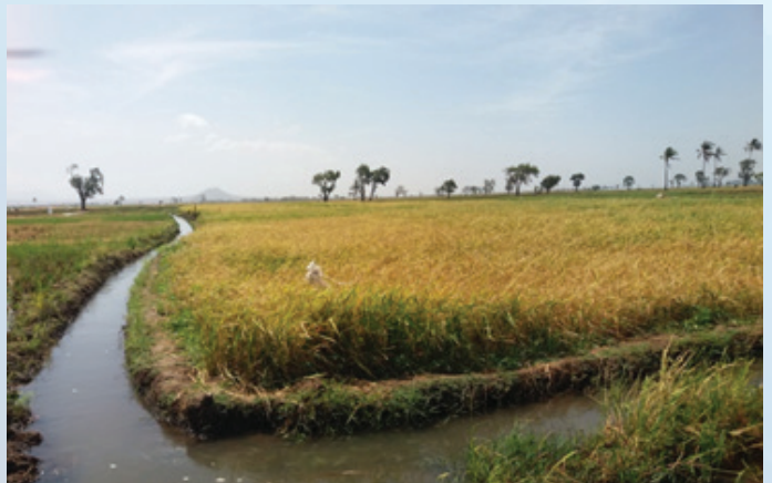
••• Rice plant at maturity stage

The application of organic materials improves the soil physicochemical properties, combining two approaches with good agronomic practices is identified to work appropriately in combating the effects of the salts within the Mawala Irrigations scheme. Increase accessibility to organic amendment materials from the agricultural communities this demand the farmers and livestock keepers to increase organic amendments supply.