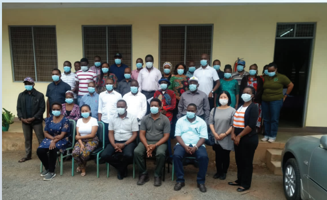
••• Group photo after Agricultural Sector Development (ASDP) and Smallholder Horticulture Empowerment and Promotion (SHEP) presentations and discussion

Then after all presentations the members made a field visit to to Chekereni area located in Moshi District Councils so that JATA members can see and talk to the beneficiaries/farmers of the project. They manage to visit Ghona and Kiterine Villages were farmers deals with horticultural crops like Onions, Egg Plants, Tomatoes and Butter nuts. In addition, members managed to visit one Nursery green house for preparing seeds before transplanting to the big farms.