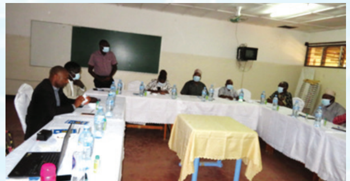
••• Meeting participants

Propose ways to improve JATA subscription collection and update JATA Data Base. They also discussed about write-ups, such as developing proposals so that they could utilize the knowledge acquired from Japan and/or to be innovative for community development. Participants were members from six zones, namely from Zanzibar, Southern Highlands, Coast zone, Lake zone, Central and Southern zone.