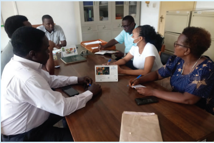
••• Courtesy call to the Office of Regional Administrative Secretary (RAS) – Kilimanjaro