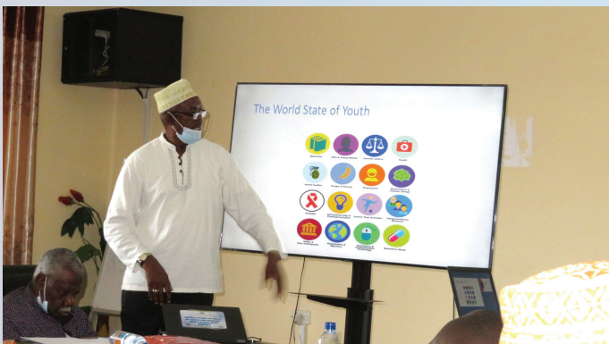
••• Presentation on Youth's Criminology in Zanzibar during the workshop at the Institution of Education for the offenders, Kilimani – Zanzibar

Upon arrival at the site, participants were welcomed by the Institute Officials who took them around the fruits growing farm. Here the Institute occupy around 10 hectares under pawpaw (carica papaya) production both in hybrid and local breeds. Day-to-day farming operations are attended by the inmates (prisoners) as part of practical training so as to impart them with farming techniques and experiences.