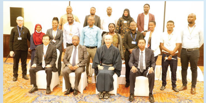
••• Group photo of the H.E. Japan Ambassador to Tanzania, Jica Chief Representative, Tanzania government officials and students for ABE-Initiative