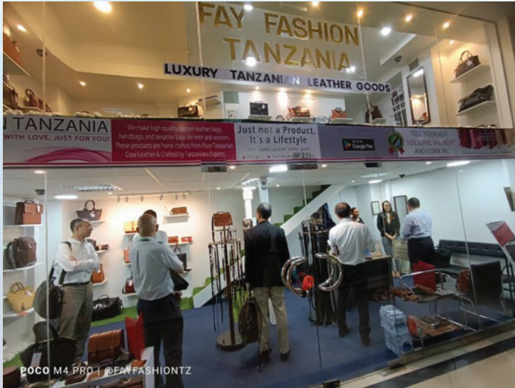
••• Group of customers for quality bags.