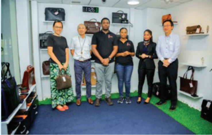
••• Group photo after the official Opening of Fay Fashion City Centre Showroom