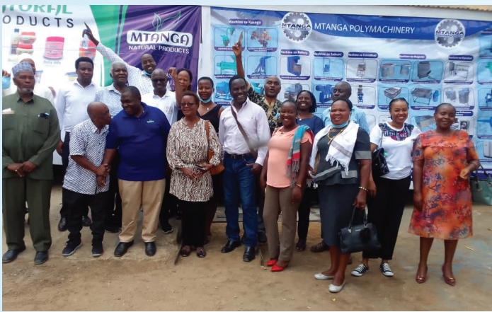
Group photo after factory visit

By visiting the project, members managed to learn various issues with regards to SHEP approach. The approach urge the farmers to starts with "Market Survey" which assist them in realization of the market demands and learned on peak season to produce for high price and so high profit. This information gives Farmers capacity to strategically plan their production scheme to maximize their profit; which includes selection of crop/varieties target quality of crops/harvesting/timing etc.