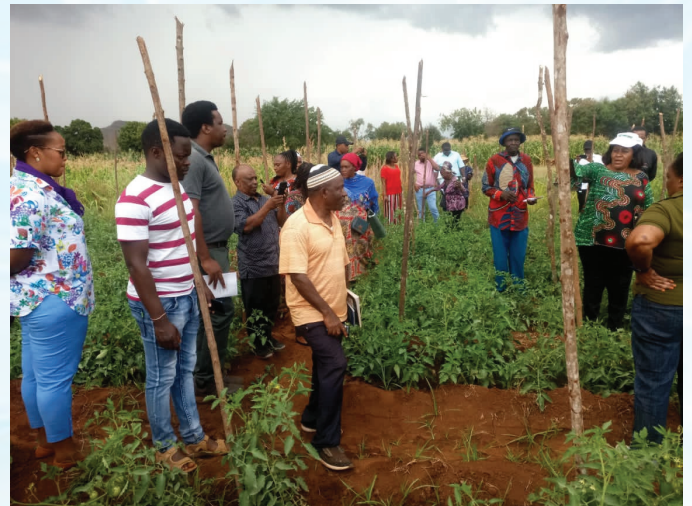
Field visit at Ghona village