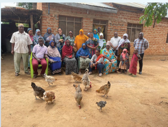
••• A site visit picture, free range poultry keeping

Most women have been trained in how to acquire loan, developing business and to manage it. Number of women in different groups has increased, which means number of households participating in economic activities through women groups has increased.