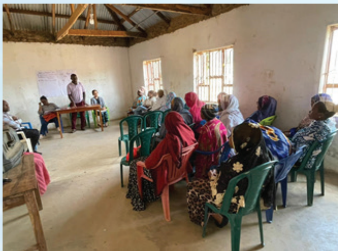
••• Women group leaders, sharing experiences and training

On the visit of Kidoka ward in Chemba district, the group leaders were free to express how they have managed to develop group norms/ constitution for their development.