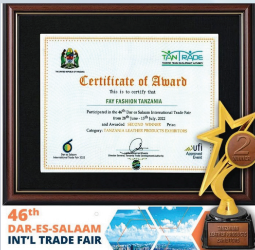
••• Fay Fashion Tanzania Sabasaba 2nd Winner