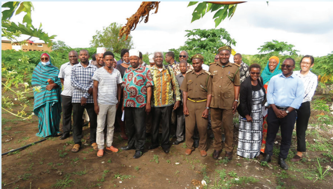
••• A visit to Hanyegwa Mchana

The Institute has established agriculture related projects, which basically provide the produce for own consumption and marketing. Currently, under crop husbandry practices there are fruits and vegetable farms; whereas with animal husbandry there is cattle, goats and sheep rearing.