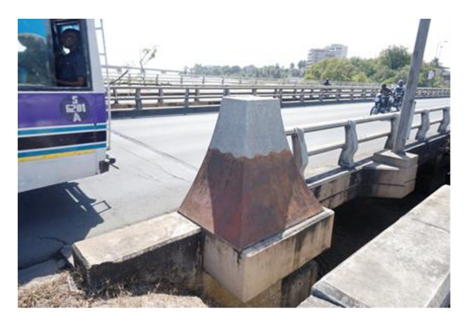
A plaque on Selander Bride, symbolizing Japan's highest mountain (Mount Fuji)