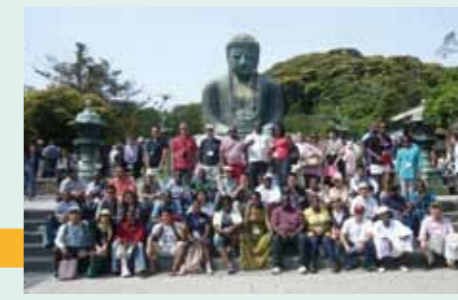
●Kotoku-in Temple (Daibutsu)