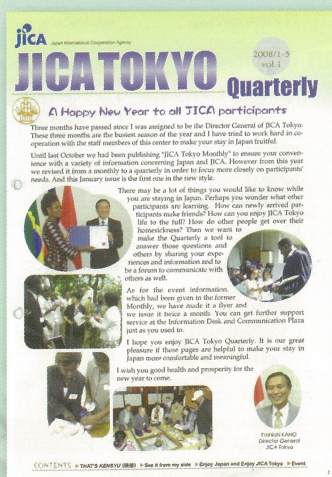
1st edition of JICA Tokyo, came out in 2008, Jan.

From now on we are to tip off about JICA Tokyo’s projects and daily lives of participants mainly via facebook, so please come in to the address shown right. See you again on our JICA Tokyo Facebook page after this! Love you!