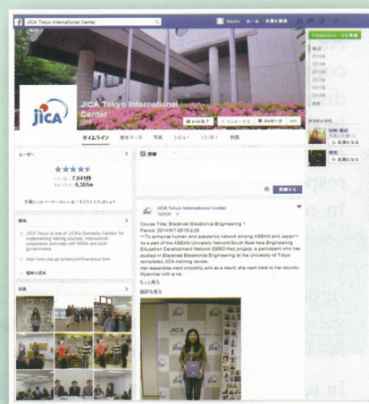
JICA Tokyo facebook top page

●JICA Tokyo facebook page https://www.facebook.com/jicatokyo