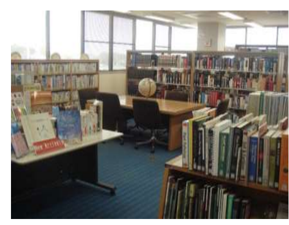
The First Library

It is our hope that this leaflet will help you navigate through the TBIC Library and its resources. For additional information, please contact librarians for assistance.