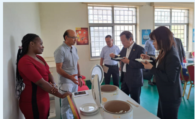
Visit to the PRiDe project & rice tasting