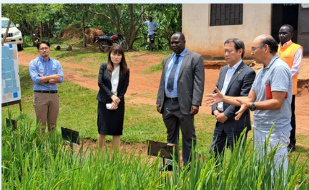
Visit to the Flyover & Nile Bridge