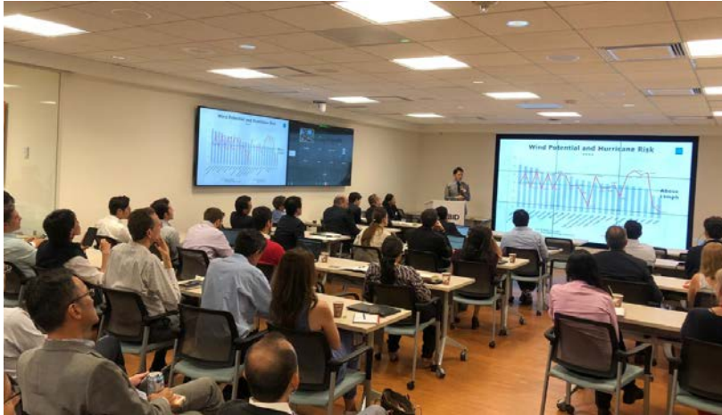
Japanese company presents on their innovative energy-sector solutions