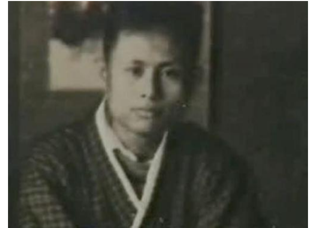
General Aung San in Japan (around 1941)