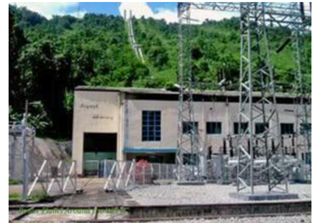
Baluchaung No. 2 HPP (completed in 1960, originally 84MW)