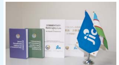
Drafting the Commentary on the Law on Bankruptcy Law (Legal System in Market Economy) (TCP '05 - '07)