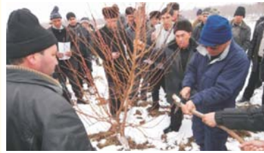
Technology Improvement for fruit growing in Ferghana Region Phase II. (JPP '08 - '11)