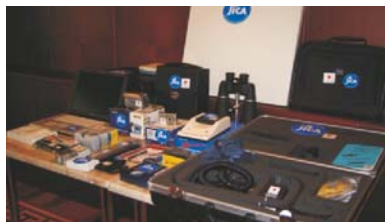
Border Management in Uzbekistan, the Kyrgyz Republic and Tajikistan (LOT 1 for Uzbekistan) (FU '07 $0.2 million)