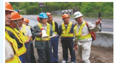
Training and Dialogue Programs (TCP ~ May '10 participants number 1471)