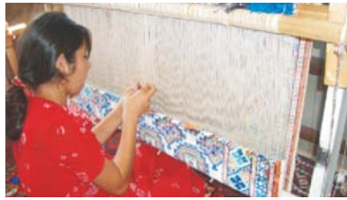
Regional Development in Karakalpakstan (TCP '08 - '11)