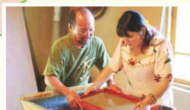
Recovering Samarkand Paper and Revitalization of Handmade Crafts in Improving the life of Koni Ghil Village in Samarkand (JPP '10 - '12)