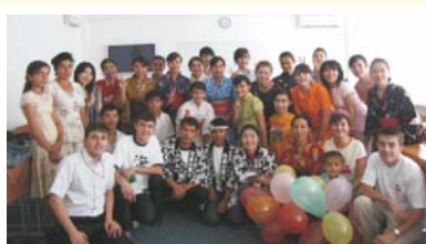
Uzbekistan-Japan Center for Human Resources Development Bukhara Branch (TCP '08 - '10)

Notes: GA : Grant Assistance TCP : Technical Cooperation Project JPP : JICA Partnership Program FU : Follow-up Cooperation Project