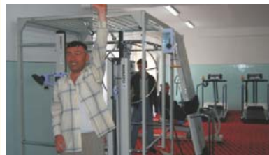
Improvement of the Equipment for National Center of Rehabilitation and Prosthesis of Invalids (TCP '09 - '10)