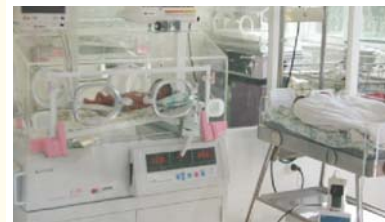
Improvement for Medical Equipment of Obstetrics and Gynecology Research Institute (GA '07 $4.1 million)