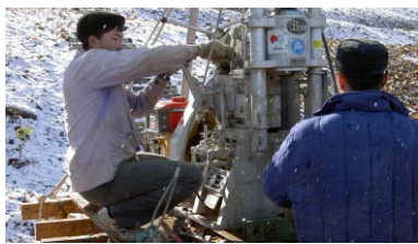
Capacity Development for Landslide Monitoring (TCP '07 - '10)