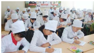
Nursing Education Improvement Project (TCP '04 - '09)