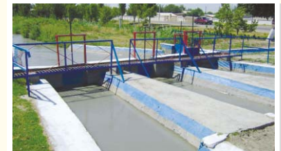
Water Management Improvement (TCP '09 - '13)