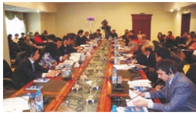
Legal Assistance for Improvement of the Conditions for Development of Private Enterprises (TCP '05 - '08)