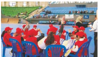
Community Based Rehabilitation Project for People with Disability in Tashkent City (TCP '08 - '10)