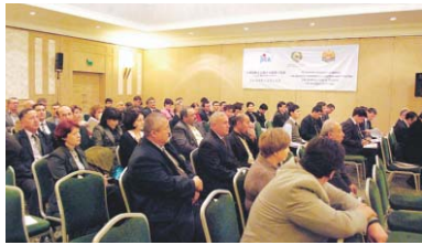
Improvement of Tax Administration of the Republic of Uzbekistan (TCP '08 - '11)