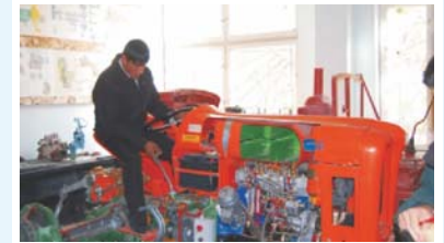
Senior Secondary Education Project (Loan '01 $70 million)