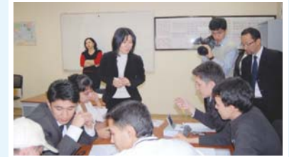
Dispatching Japanese Overseas Cooperation Volunteers (TCP ~ May '10 Dispatched number 106)