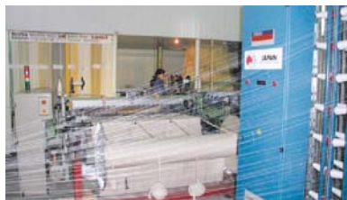
Equipment Supply to the Tashkent Institute of Textile and Light Industry (GA '00 $4.9 million)