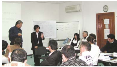
Uzbekistan-Japan Center for Human Resources Development (Phase 1, 2) (TCP '00 - '10)