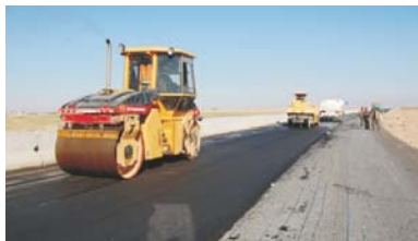
Supply of Road Construction and Maintenance Equipment (Phase 1, 2) (GA '97 $10.7 million, '05 $10.8 million)