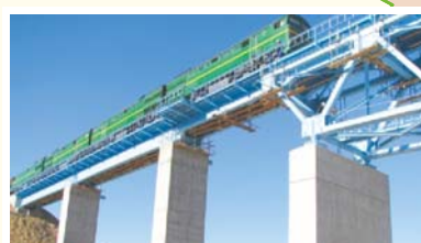
Tashguzar - Kumkurhan New Railway Construction Project Surkhandarya & Kashkadarya (Loan '04 - '10 $181.8 Million)