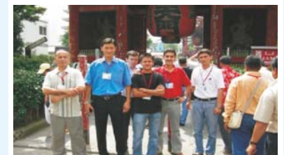
Japanese Grand Aid for Human Resource Development Scholarship (GA '00 ~ $28.5 million, 191 fellows as of 2010)