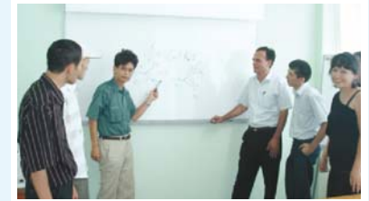
Dispatching Senior Volunteers (TCP ~ May '10 Dispatched number 43)