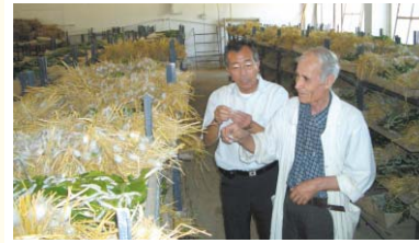
Revitalization of the Silk Road Silk Industry in Uzbekistan - Developing a Rural Income Generation Model by the Improved Sericulture in Ferghana Valley (JPP '09 - '12)