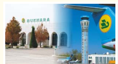
Three Local Airport Modernization Project in Samarkand, Urgench, Bukhara (1)(2) (Loan '96 $172.5 million, '99 $31.9 million)