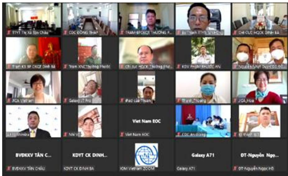
Seminar on “COVID-19 prevention and safe migration during the COVID-19 pandemic “

From July 2021 to January 2022, JICA has coordinated with the International Organization for Migration (IOM) to strengthen the infection-disease prevention system in 5 provinces bordering Laos and Cambodia through “The project for Capacity Development for Medical Laboratory Network on Biosafety and Examination of Highly Hazardous Infectious Pathogens in Vietnam, Laos and Cambodia”.