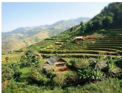
Rural landscape in northern Vietnam

About 14 % of Vietnam’s population belongs to 53 ethnic minority groups, many of whom live in border areas and have their own dialects. The Japanese International Cooperation Agency (JICA) is taking advantage of the resources of its partner organizations to respond to the Vietnamese Government's measures against COVID-19, supporting the ethnic minority people who lacks information about the pandemic due to language barrier.