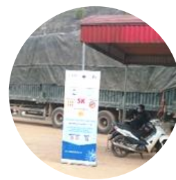
Posters used in border areas (Ha Tinh Province)