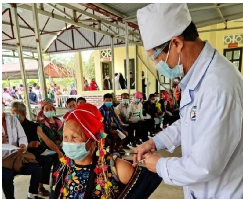
Ethnic minority women who visited for vaccination (Lai Chau Province)