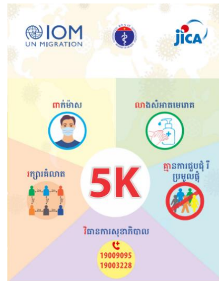
MOH’s propaganda posters on infection controls and health declarations are prepared in Lao and Khmer dialects to be used in border areas.