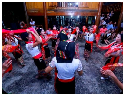
Ethnic minority people in Nghe Anh Province, north-central Vietnam