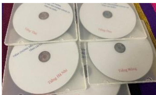
Audio disks published in various dialects

In Lai Chau Province bordering China, JICA has been supporting COVID-19 vaccination campaign of Lai Chau Department of Health (DOH) through the Project of “Support for strengthening the maintenance and capacity of Lai Chau DOH’s vaccination system”. Through this project, JICA has provided medical equipment such as contactless thermometers, sphygmomanometers, hand sanitizers etc. for vaccination at 116 vaccination sites and conducting training for health workers.