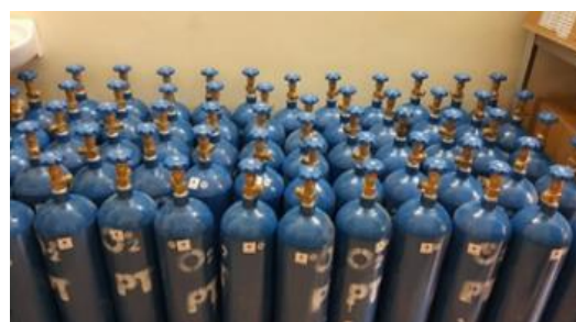
Oxygen tanks provided in vaccination sites