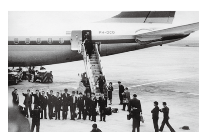
First batch of volunteers departing for their assignments (1965)

(1) To cooperate in the economic and social development, as well as the reconstruction of developing countries