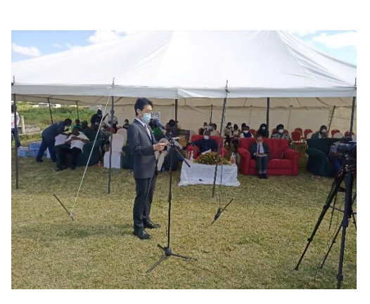
Japanese Ambassador to Zambia (L) and JICA Chief Representative (R) officiating at the ground breaking ceremony of upgrading Health Centres at the Copperbelt.