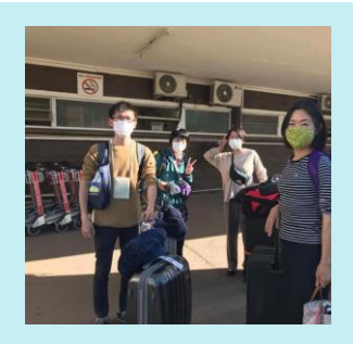
FOUR (4) JICA Volunteers returned to Zambia in April, 2021 following their evacuation due to COVID -19 in 2019