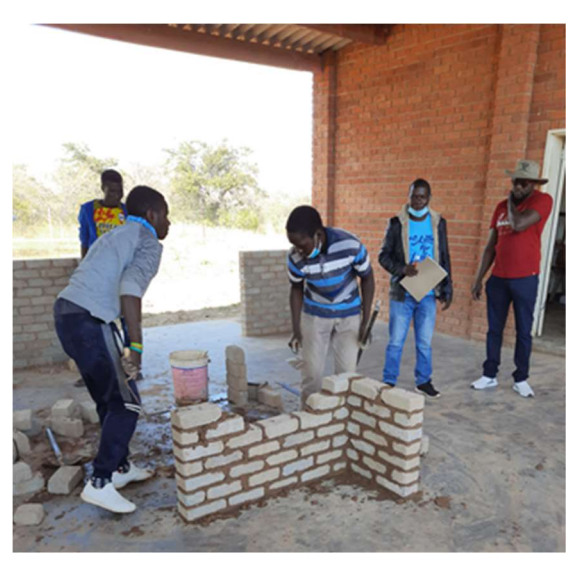
Students go through their building lesson at Kaguvi Vocational Centre which is anticipating to receive a JOCV in Building

The Japan Overseas Cooperation Volunteers (JOCV) program which to date has seen 560 volunteers being dispatched to Zimbabwe has been commended for promoting human capital skills development at institutions of Higher and Tertiary education.