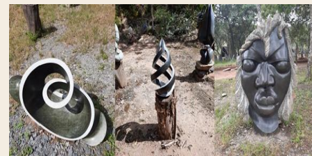
Some of the artefacts being crafted at Tengenenge attract the International Market

JICA together with the Ministry of Environment, Climate, Tourism and Hospitality Industry (MECTHI) is working with communities to derive economic benefit from the tourist attractions in their locality. Through the Community Based Tourism (CBT) Project, JICA and MECTHI are engaged in a technical cooperation project where locals are equipped with skills encompassing tourguiding, marketing, bookkeeping and tourism. The project is being implemented at four CBT pilot sites and these are the Tengenenge Arts and Culture Centre in Mvurwi, Chesvingo Village in Masvingo, Gairezi Ecotourism Project in Inyanga and the Heritage sites in Bulawayo.