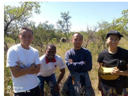
JOCVs and their Counterparts experience Zimbabwean tourism in Matopos