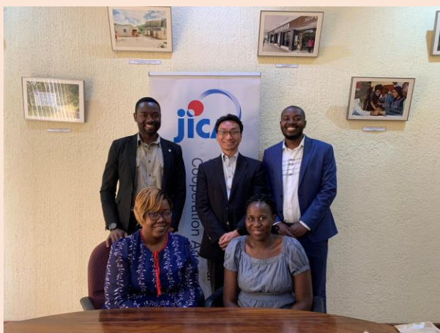
The 2023 recipients of JICA Scholarships