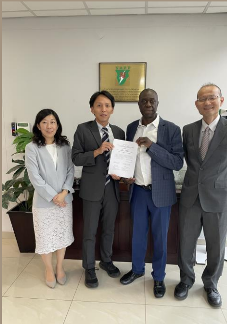
JICA and SAPP Experts sign the Minutes of Meeting

JICA continues to make strides in assisting Zimbabwe and the region in sustainable development. On September 27, JICA HQ and Southern African Power Pool (SAPP) signed the Minutes of Meeting for the project “Strengthening Regional Power System of Southern African Power Pool”.