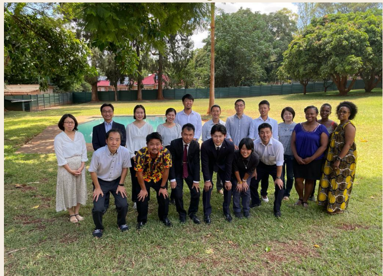
JICA volunteers with JICA staff

The Japan Overseas Cooperation Volunteers (JOCVs) play a very important role as they give of their time, effort and skills to find solutions, create change in their different host organisations, make a difference in people’s lives every day, and ensure the betterment of communities they work and live in. JICA staff is grateful to JOCVs and applaud their impressive work.