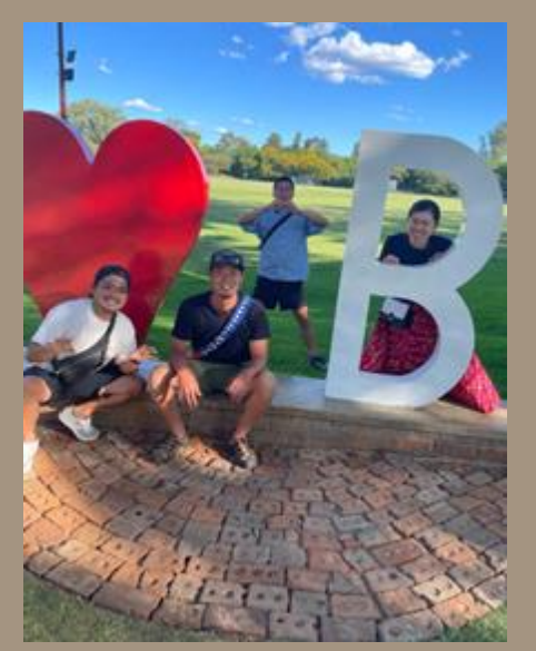
JOCVs have been unable to resist Zimbabwe's hospitality. After fulfilling their day to day assigned roles at various institutions they are attached to, volunteers in the spirit of living and working together have always found sometime to interact amongst each other and with locals whilst enjoying the hospitality that the country offers.