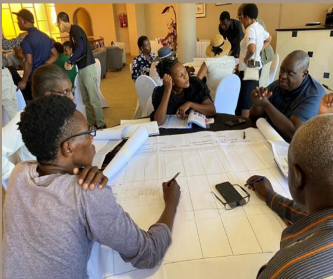
Discussion of Crop Calendar Making for Matabeleland North

The next activity planned is the ZIM-SHEP's Participatory Baseline Survey to be conducted in each target district.