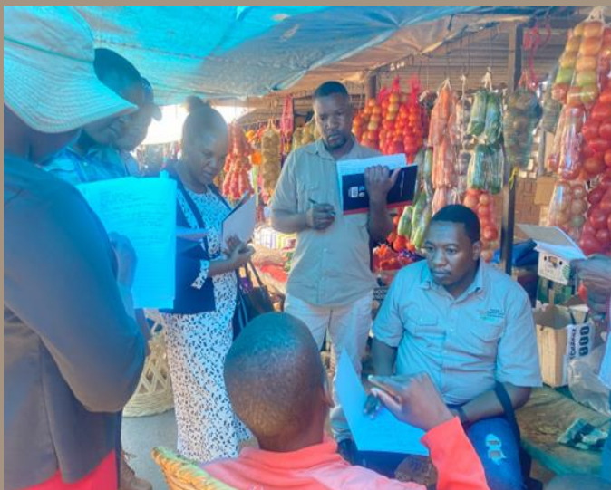
Market Survey Exercise by Matabeleland North Officers

The Project for Zimbabwe Smallholder Horticulture Empowerment and Promotion (ZIM-SHEP) team conducted SHEP Training of Trainers (ToT) in Matabeleland North province in March and Matabeleland South province in April 2024. A total of 16 agriculture officers from each province took part in the training. Participants included provincial, district, Agricultural Extension Supervisors (AES) and Agriculture Extension Officers (AEO).