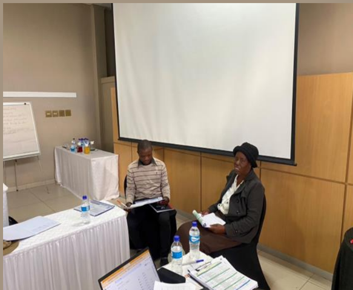
Mock of Market Survey Exercise by Matabeleland South Officers

In the Market Survey exercise, participants conducted a mock interview with local buyers from Entumbane open market. Participants have gained confidence through the practical exercise.