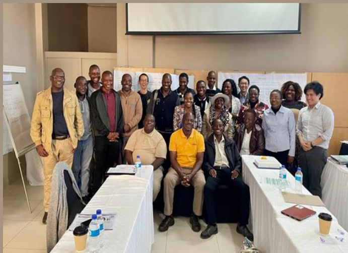
Group photo of Matabeleland South Officers with HQ Officers and Experts