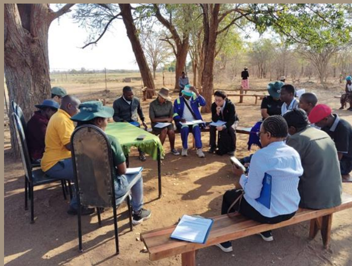
An extension officer explaining the process from market survey, crop selection to crop planting calendar making

Another farmer said, 'It is important to build trust with the buyer, so we need to communicate frequently with them.'