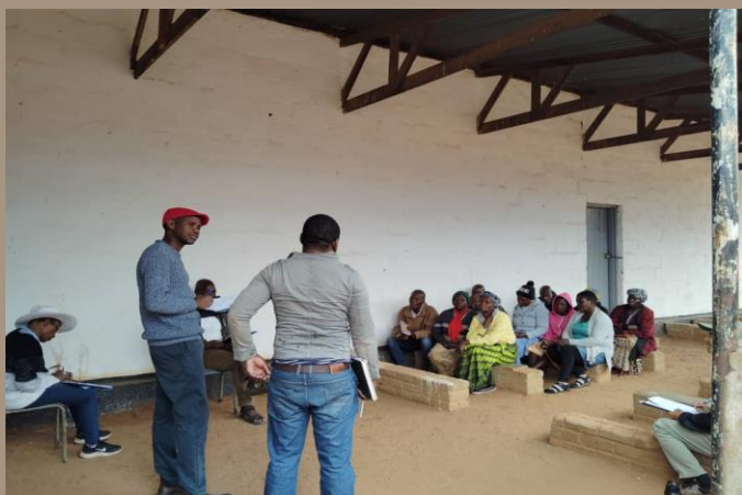
A HQ member and district officer asking details of how they conducted activities after market survey

The Project for Zimbabwe Smallholder Horticulture Empowerment and Promotion (ZIM-SHEP) Headquarters (HQ) Team and Matabeleland North team conducted Follow-up visits on target farmer's activities after the market survey at Hauke (Bubi District), Tshongokwe (Lupane District) and Chentali (Hwange District) Irrigation Schemes from 23rd to 25th of September 2024. The visits to Matabeleland South were implemented from the 14th to the 16th of October 2024. Irrigation schemes followed include Antelope (Matobo District), Moza (Bulilima District) and Masholomoshe (Gwanda District).