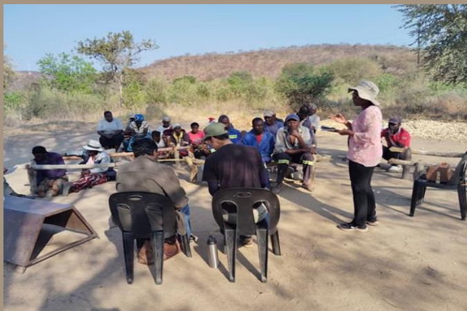
A HQ member asking details of how the farmers conducted activities after market survey

The team held focus group discussions with AES and AEO, farmers' representatives who conducted the market survey and other farmers in the irrigation schemes. The teams administered questionnaires designed by the project to enquire about the process focusing on how the farmers planned, carried out the market survey, feedback meeting sessions, selected target crops and developed the crop calendars for each chosen crop. These activities after the market survey are essential steps to assist farmers in making effective decisions and promoting collective action in the "Grow to Sell" concept.