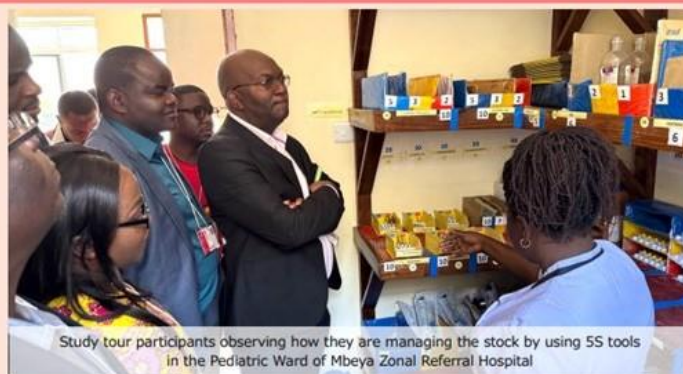
Study tour participants observing how they are managing the stock by using 5S tools in the Pediatric Ward of Mbeya Zonal Referral Hospital