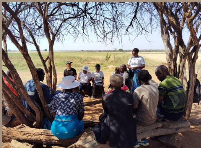
A district officer wrapping up on the day's monitoring activities

In addition, other project activities in the pipeline for the ZIM-SHEP team include conducting the Endline Survey in Mashonaland West and Masvingo targeted schemes.