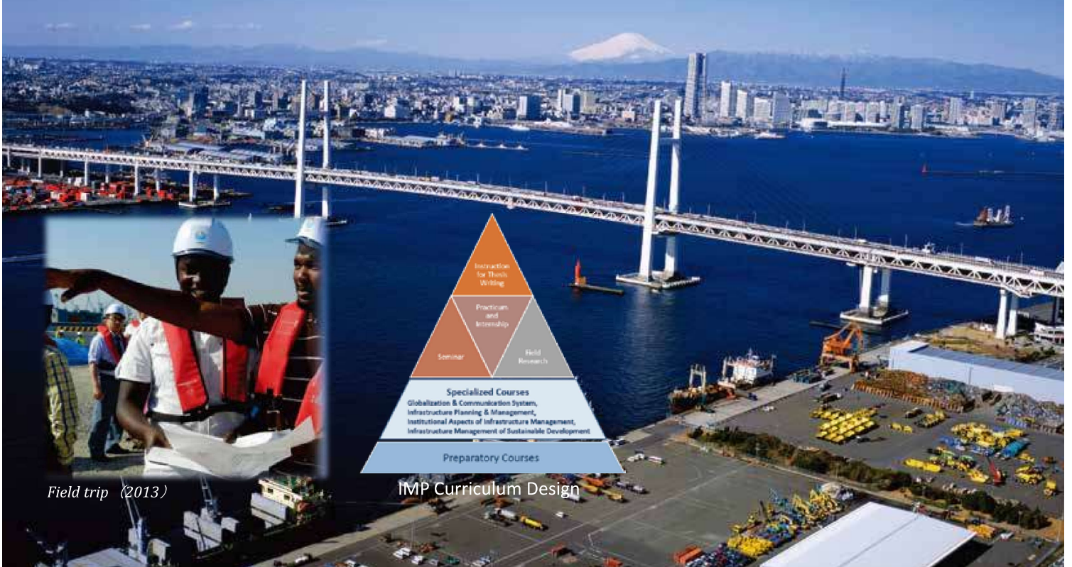
Field trip (2013)

*The schedule may be moved forward. Please keep checking for updates on our website.