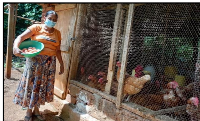
Poultry Farming- Self employed