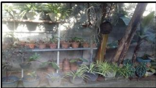
Plant Nursery- Self employment