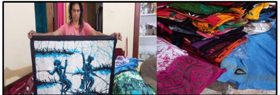
Fabric and Batik designer- Self employed