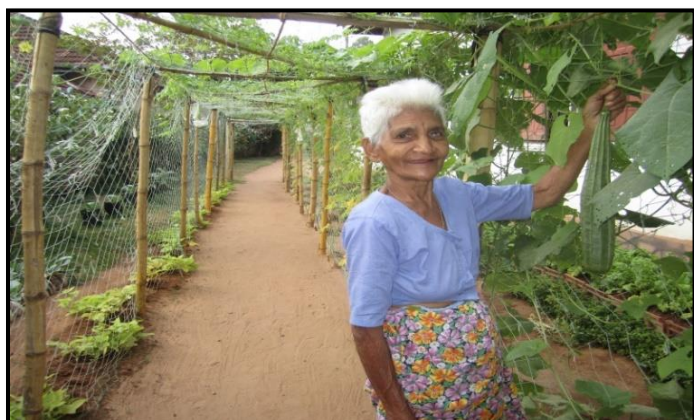
Gardening- Self employed