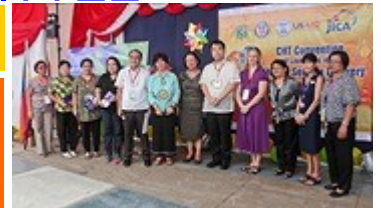
DOH, PHO, USAID &