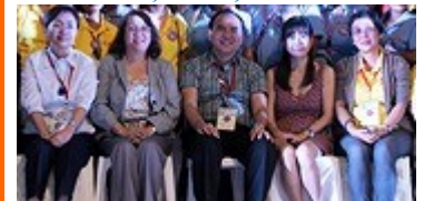
DOH, PHO &