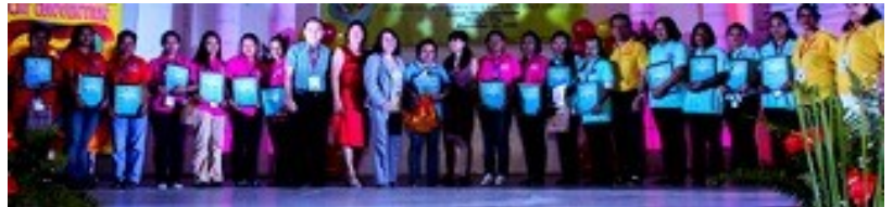
Counterclockwise: The awardees for the Outstanding CHTs; Singing of the solidarity song If We Hold on Together ; capacity enhancement activity; Cluster 2 committee; awarding of winners; and commitment signing