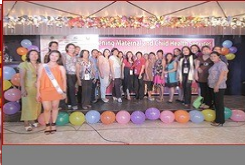
Ormoc city - Ipil, Valencia, San Pablo, Curva & Linao Districts