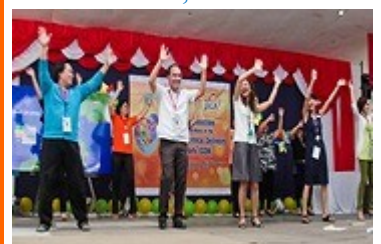
JICA staff with DR.