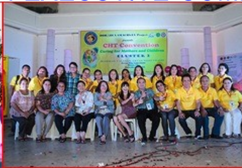
Cluster 2 - Kammas, Calesan & Leyte West Coast