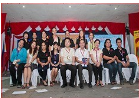
Cluster 3 — Leyte Gulf, Golden Harvest, Leyte Plains