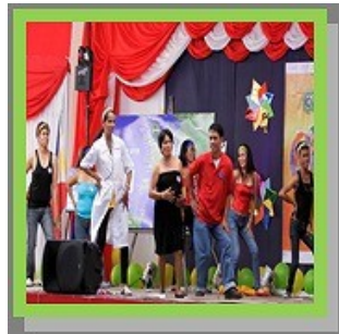
Right (top-bottom): Gov. Bagulaya with the USAID and JICA representatives; Cluster 3 CHT awardees; Commitment signing; Singing of the solidarity song; Left-Right: Capacity Enhancement activity; health promotion presentation;