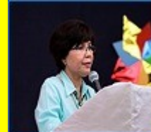
Hon. Ma. Mimietta Bagulaya Governor Province of Leyte