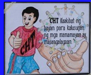
"CHT: Link Towards Kalusugan Pangkalahatan" The winning slogan from the RHU of

Nalipay ko kaayo nga nakatabang ug nakahatag ko ug serbisyo ngadto sa akong isig katawo". I was surprised when I was informed that I am gonna be representing our town as one of the nominees for the Provincial Outstanding CHT. I never expected and it never came into my mind that JICA & DOH would appreciate my time & effort.