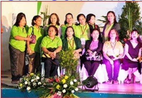
Cluster 1 — Mabahinhil, Mainbay & Maharlika